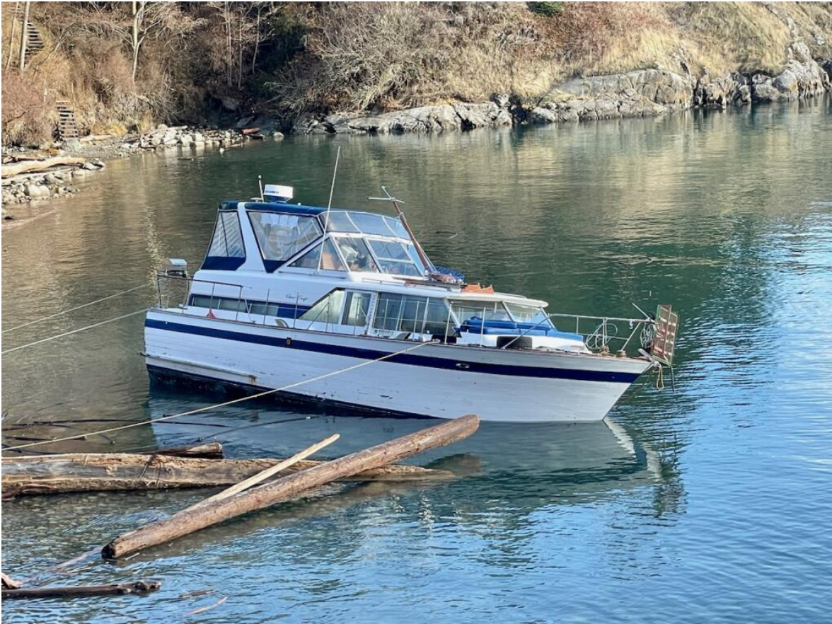
Vessel aground in Aleck Bay

On 12/12/22 , IOSA received an email regarding a boat that had been abandoned at the County Boat dock in Obstruction Pass. The information was shared with the County Derelict Vessel Program. On 12/23/22, severe weather was impacting the County. IOSA received a report that the Sheriff's Office was responding to a boat that was in danger of sinking at the Obstruction Pass Dock. Utilizing resources and information from the public, IOSA, the Sheriff's Department and the Derelict Vessel Program, the boat was removed from the water before it sank. The removal saved countless hours of cleanup that would have included debris and a small amount of petroleum products. A great example of working together to get things done.